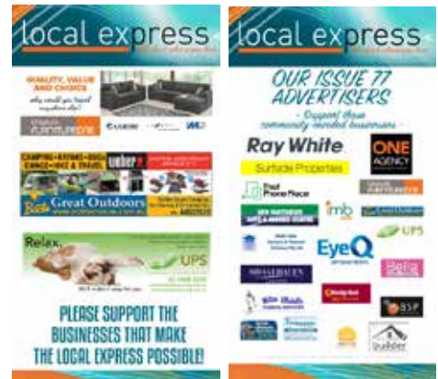
Examples of inscreen advertising

This exposes your brand and ad content to thousands of visitors and members EVERY MONTH and thousands upon thousands during the busier months / holiday period.